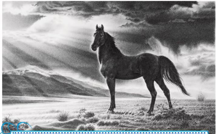
Spirit Of The Valley

and Peace, I was captivated. I no longer saw the storm for the healing rays of light profoundly felt like God was in the valley.