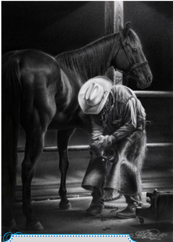
A Long Day