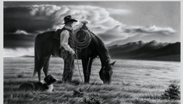
Won the top award of Peoples Choice “1st Place- Best of Show” at the 2019 High Peaks art exhibition at the Sangre de Cristo Art Guilds summer show in Westcliffe, CO.